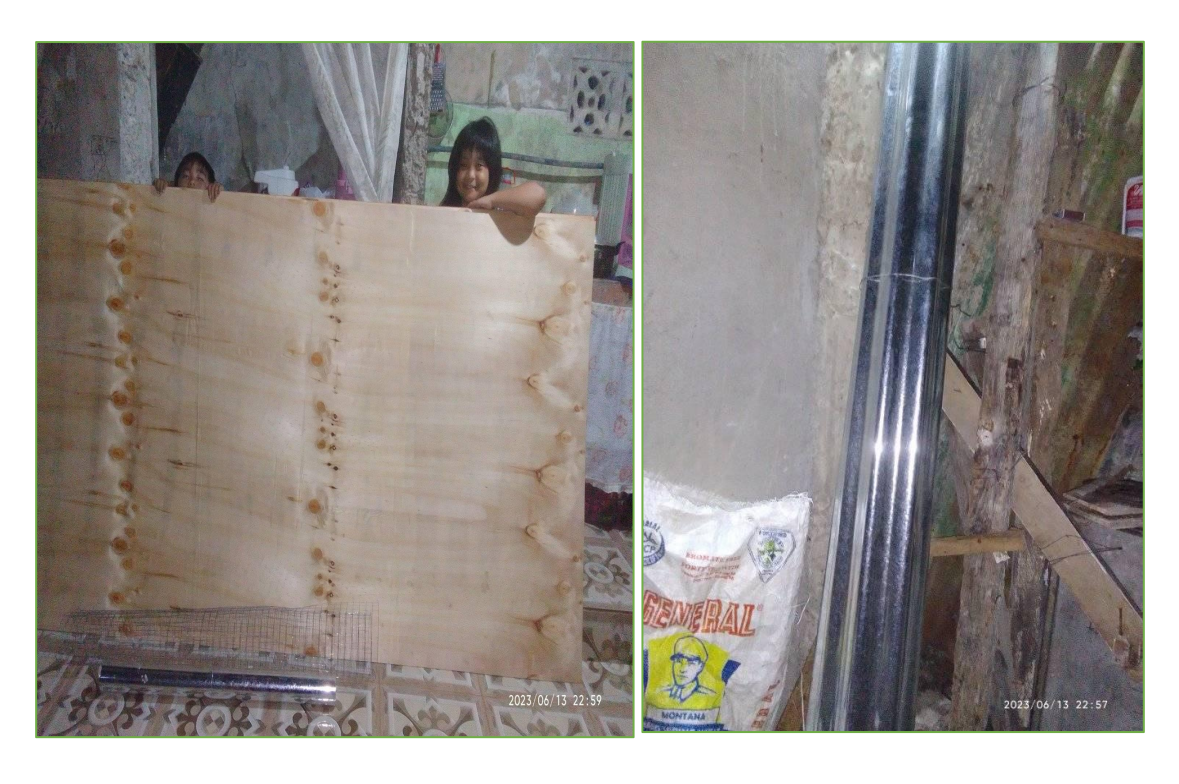
Materials for building their retail store