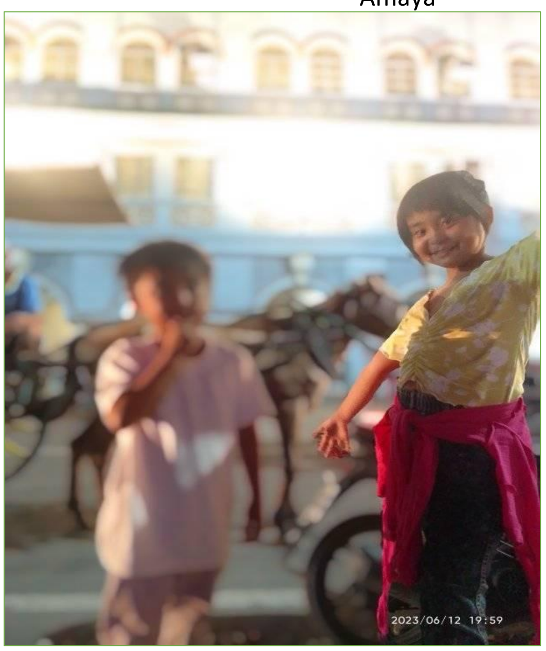
Me and my brother @ Carbon