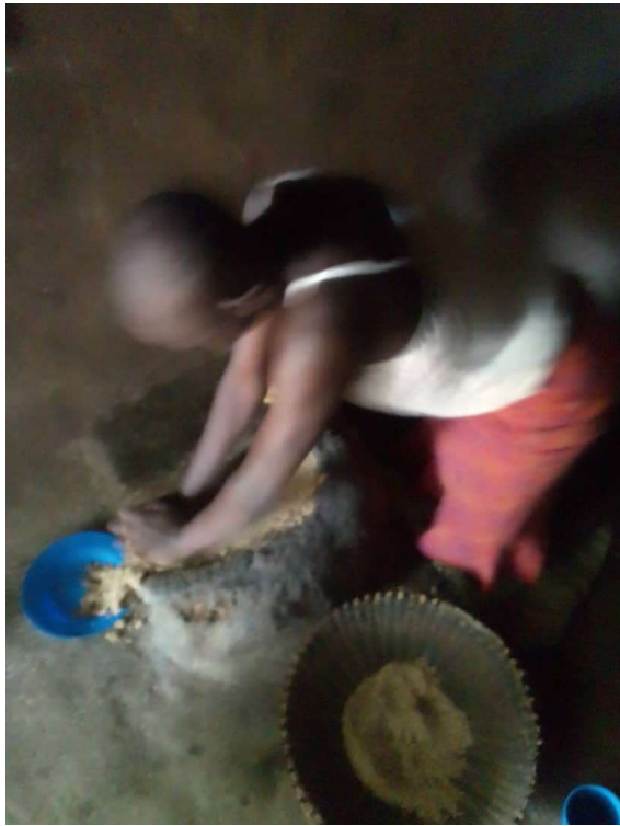
Abol cooking and grinding simsim using a grinding stone